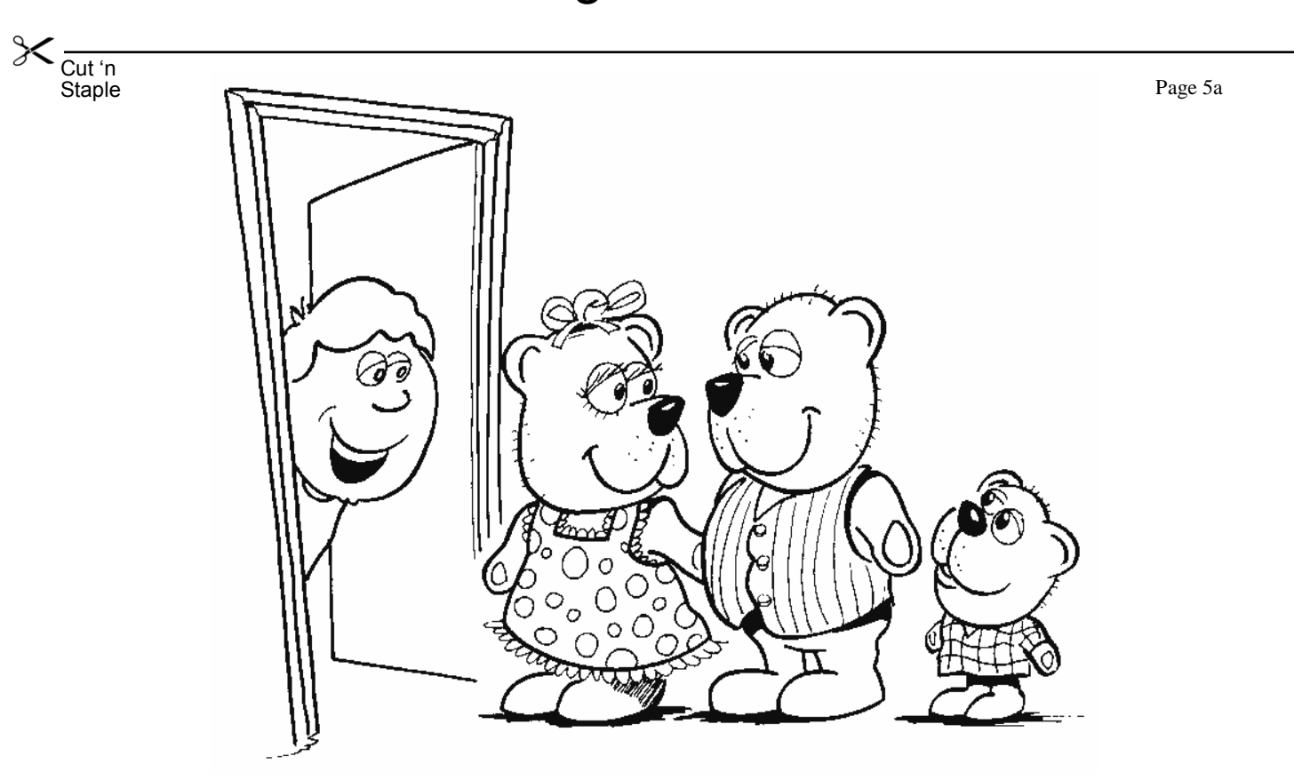
"Only Mummy, Daddy and Baby bear!"