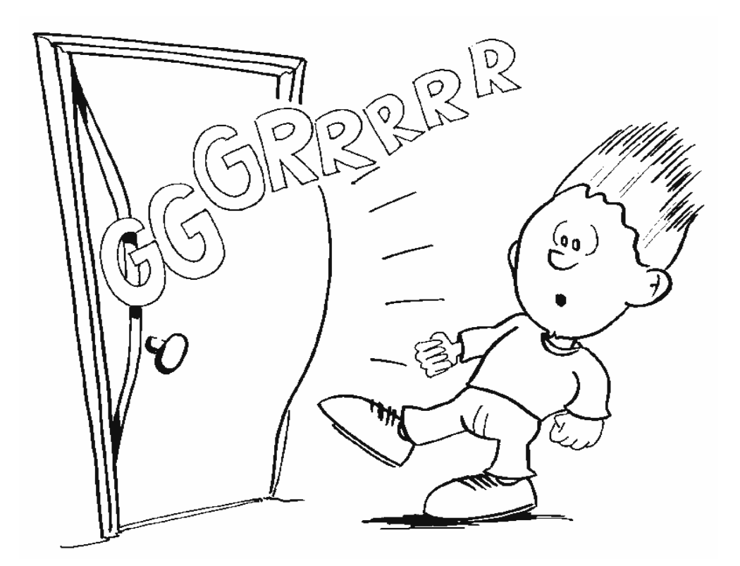
It sounds so close, I'm sure it's just outside the door.