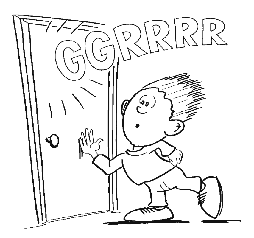
Quiet, listen - again, I can hear it very clear.