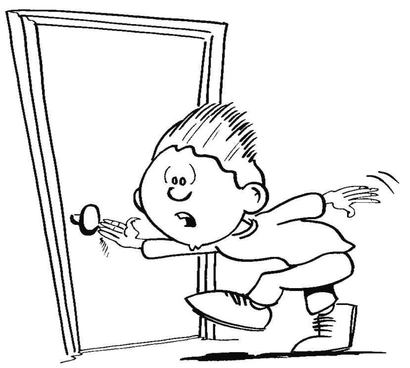
I went to the door. I asked, "Is anyone there?"