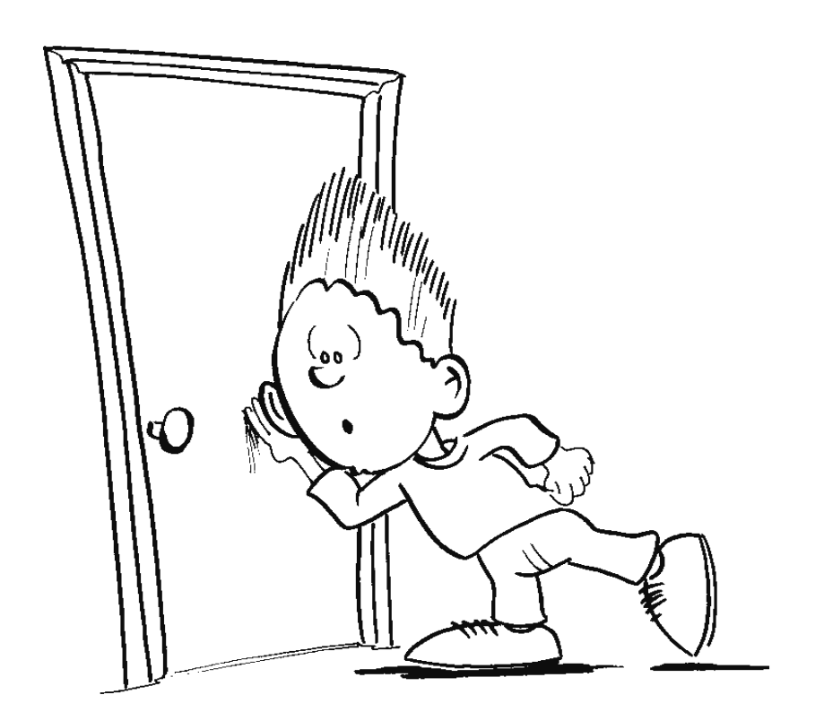
I thought I heard the roar of a boar.