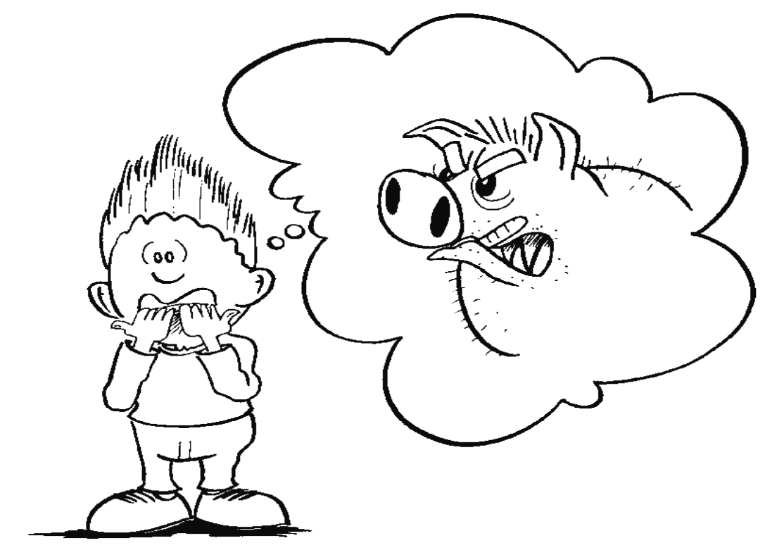
Hush now, listen - again I hear the roar of a boar.