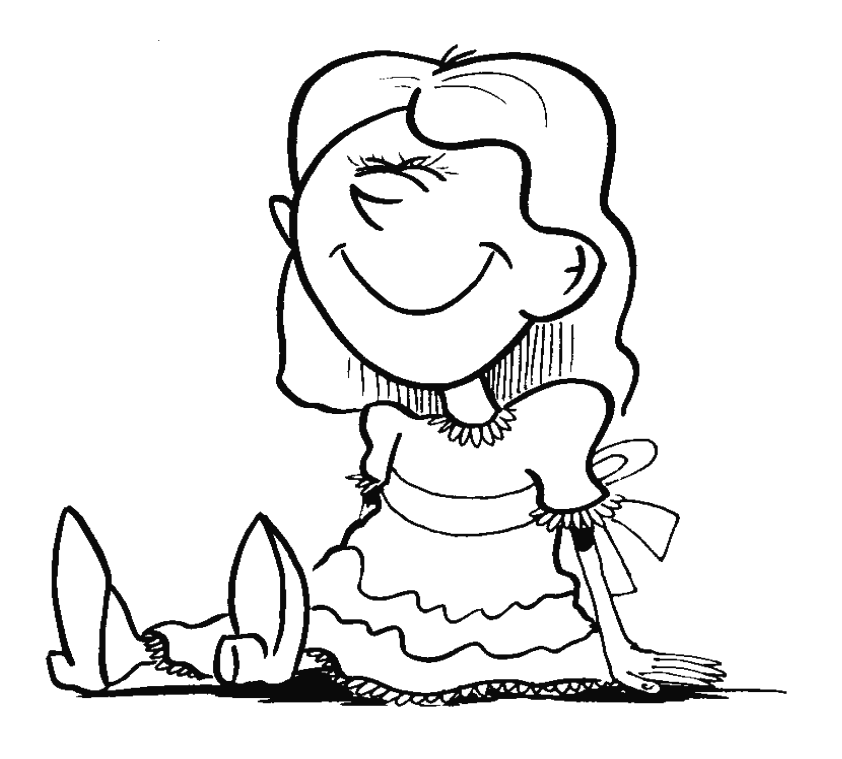
I put a brave smile back on my face.