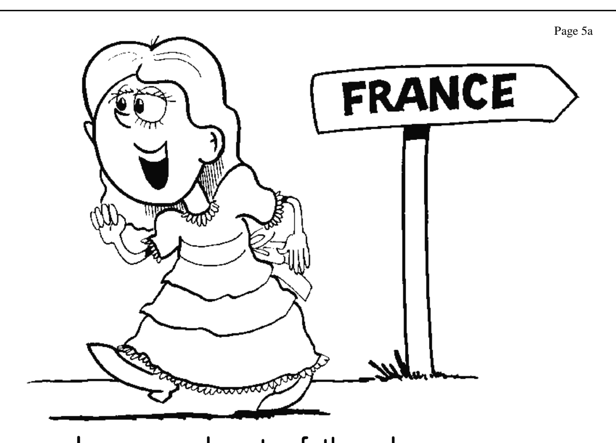
I pranced out of the dance, and out of France.