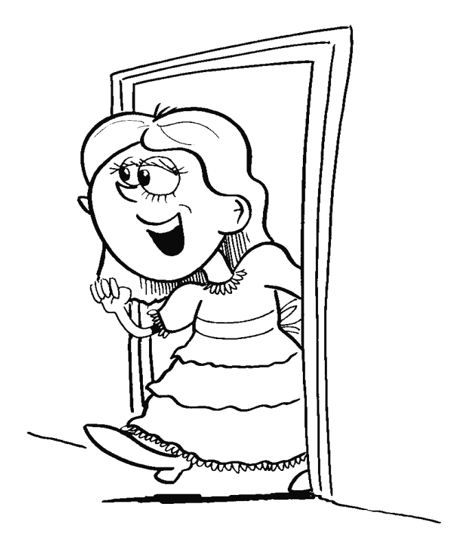
Without a sound, without a glance, out the door, I did prance.