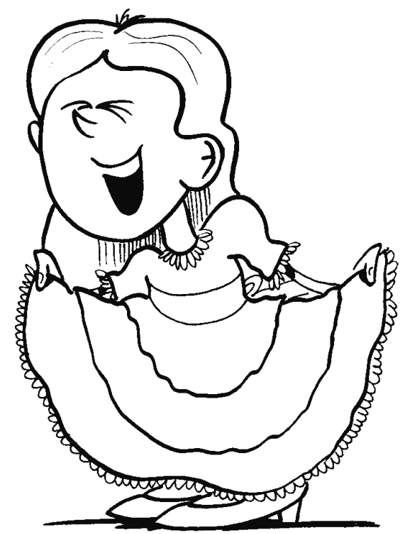
First I did a slow waltz and then I joined a dance.