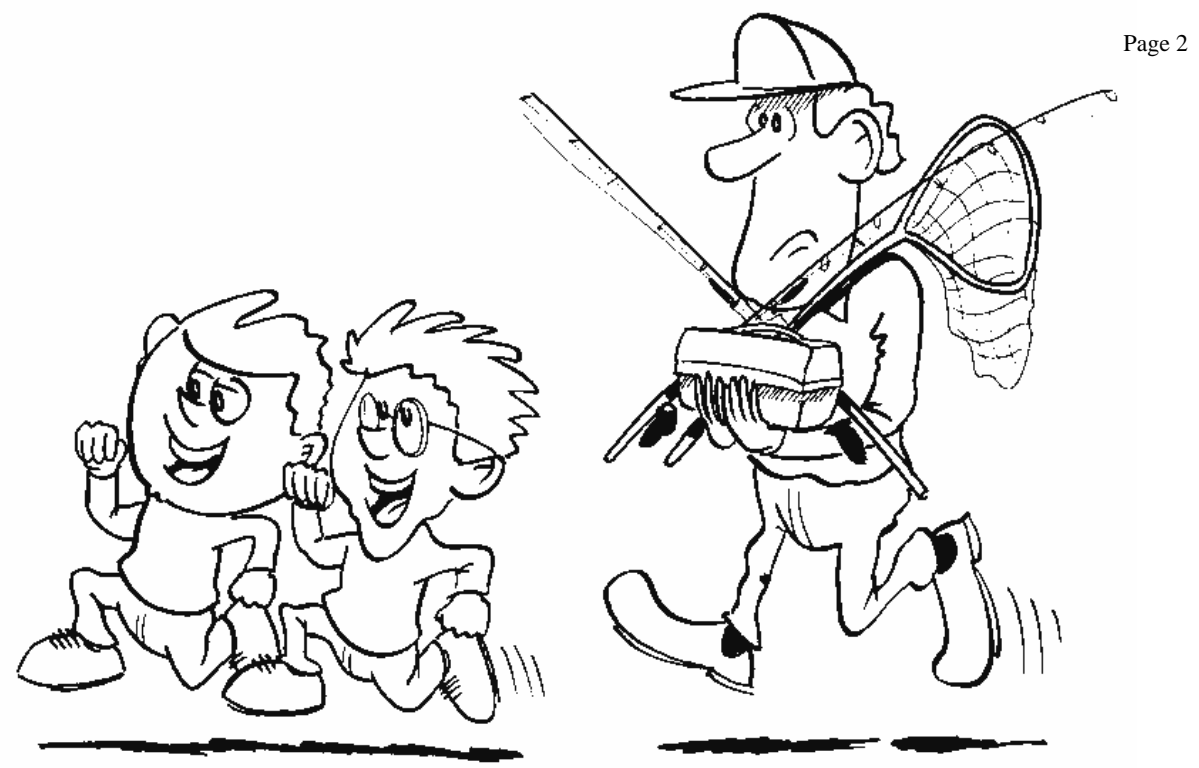
We went to the river to catch some trout.